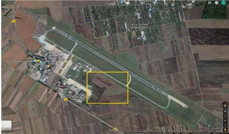
Figure 1: Land acquisition planned for 2027 (general area)